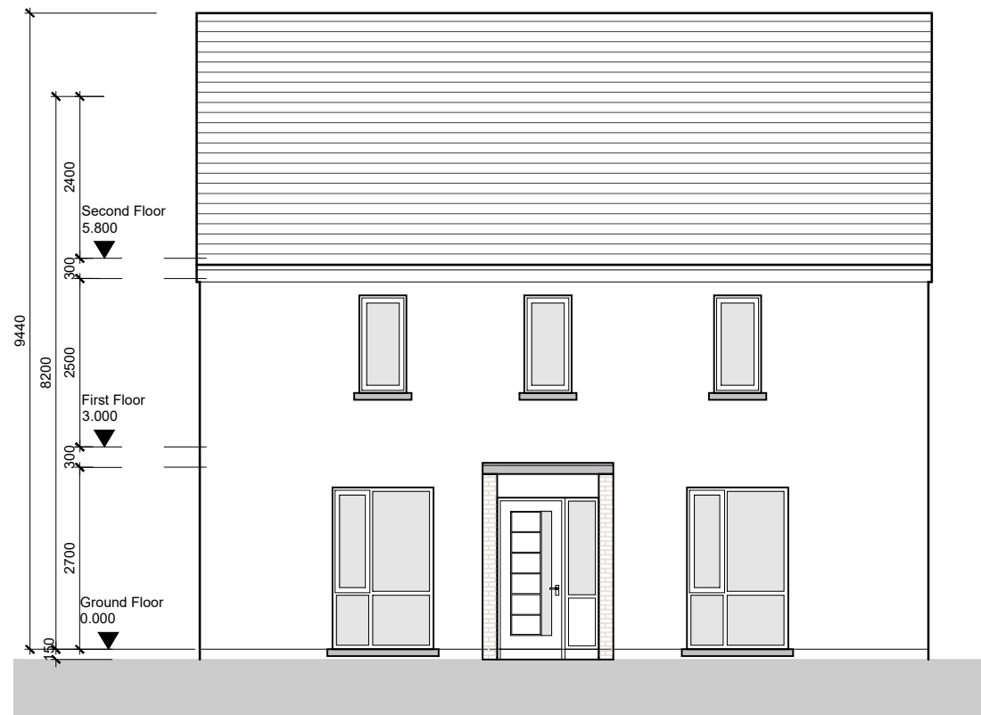
Side Elevation 01